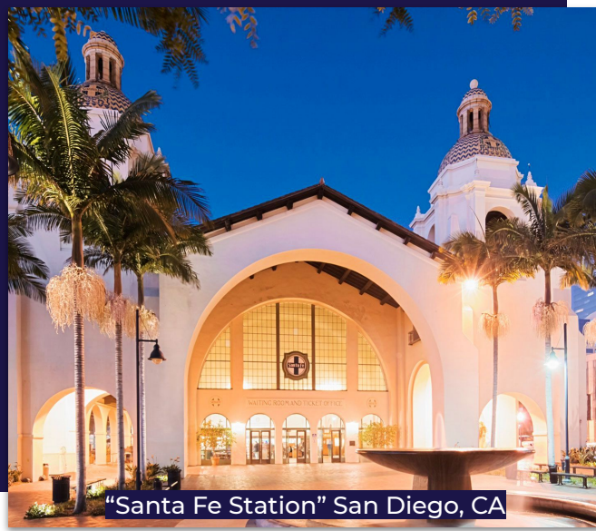
"Santa Fe Station" San Diego, CA